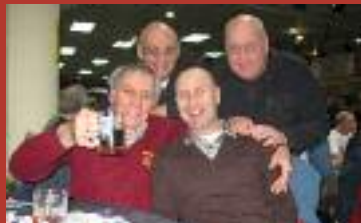
Other: Potteries CAMRA Members enjoy The National Winter Ales Festival in Manchester.